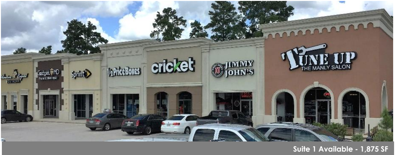
Suite 1 Available - 1,875 SF